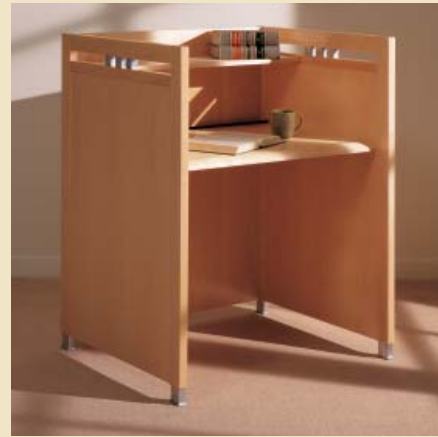
Alcott Study Carrel