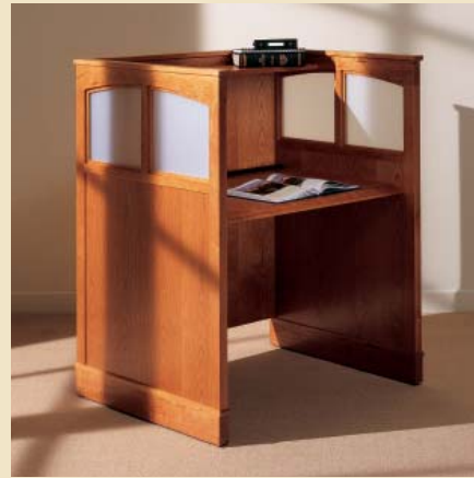
Thoreau Study Carrel