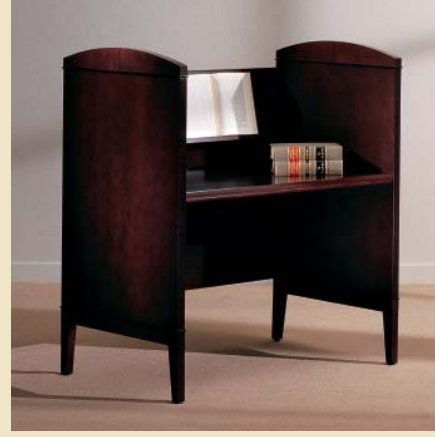
Twain Study Carrel

The American Classics tradition continues into unique and coordinating casegoods with workstations, atlas stands, dictionary stands and computer stations designed to perfectly compliment the American Classics Tables.