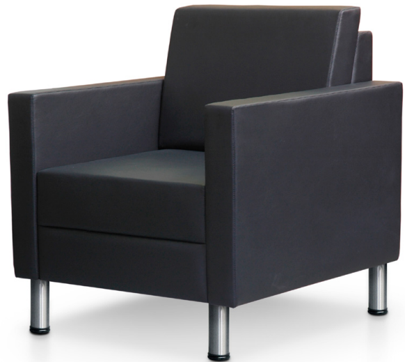
model 68001 edge chair with metal legs