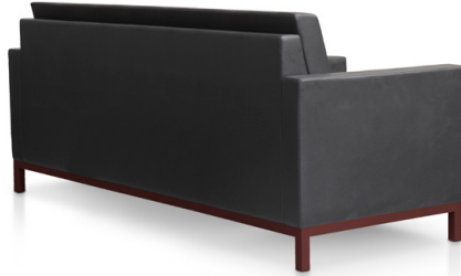
model 68003-W edge three seater with wood base