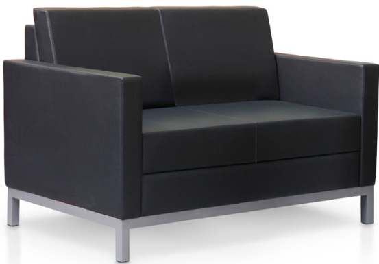
model 68002-M edge two seater with metal base