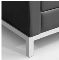
brushed steel base